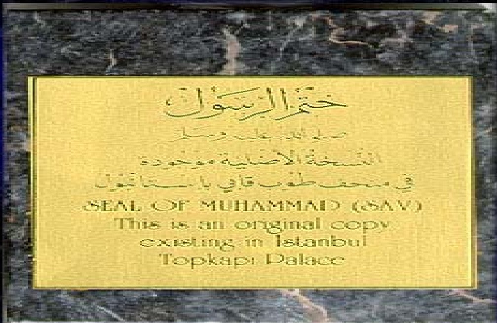
Seal of Muhammad ( s.a.v. )